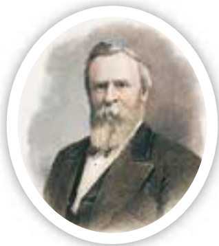
RUTHERFORD B. HAYES (1877-1881)

“Nobody ever left the presidency with less regret . . . than I do.”