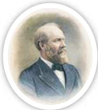
JAMES A. GARFIELD (1881)

“Nobody ever left the presidency with less regret . . . than I do.”