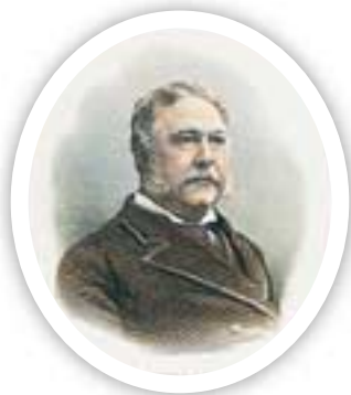
CHESTER A. ARTHUR (1881-1885)

“Assassination can be no more guarded against than death by lightning.”