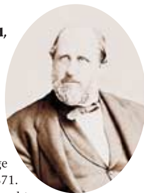
▲ Boss Tweed, head of Tammany Hall.

Thomas Nast, a political cartoonist, helped arouse public outrage against Tammany Hall’s graft, and the Tweed Ring was finally broken in 1871. Tweed was indicted on 120 counts of fraud and extortion and was sentenced to 12 years in jail. His sentence was reduced to one year, but after leaving jail, Tweed was quickly arrested on another charge. While serving a second sentence, Tweed escaped. He was captured in Spain when officials identified him from a Thomas Nast cartoon. By that time, political corruption had become a national issue.