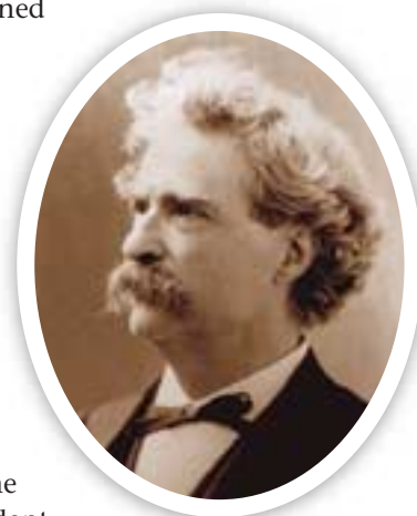
▲ Mark Twain

—quoted in To the Person Sitting in Darkness